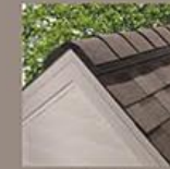
VentSure® Ridge Ventilation