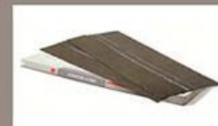
Starter Strip Shingle