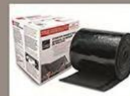
Starter Shingle Roll