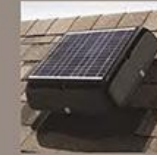
VentSure® Solar Attic Exhaust Fan